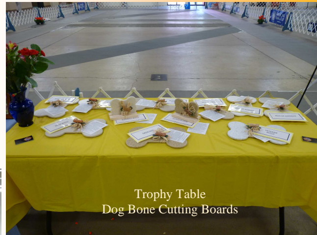
Trophy Table Dog Bone Cutting Boards